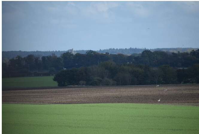
Distant view of St Mary's Parish Church Mildenhall – reflecting the current visual connectivity between Churches